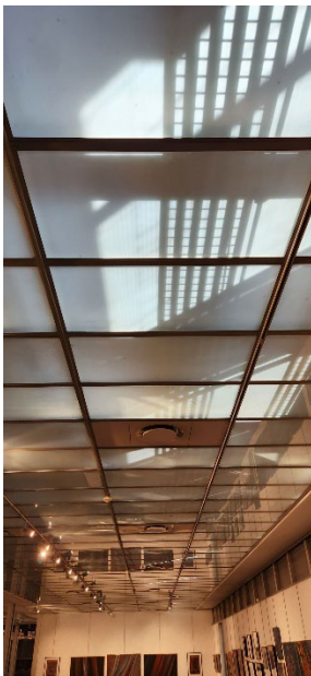
Ceiling with closed sections