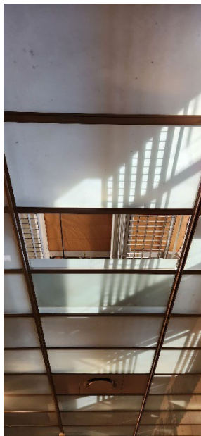
Example of open sections